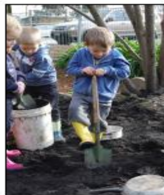
Using large muscles in the dirt (digging) patch.