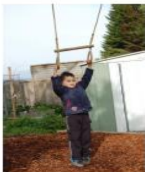
Learning and achieving new gross motor skills.