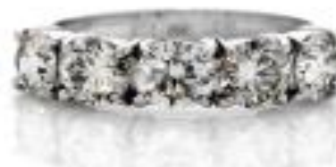
Claw Set Band