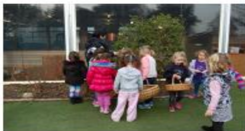
Group project. Working together for the same