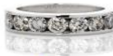
Channel Set Band